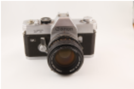
Pietropaolo's first professional camera, Toronto, 1969

These images of migrant farm workers were published in Pietropaolo's book, Harvest Pilgrims .