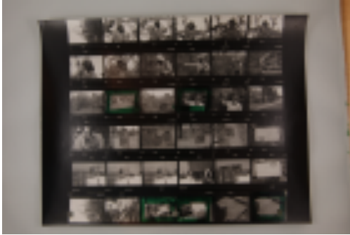
Photo contact sheet, Thornbury, Ontario, 1987

He documented his community and identity as an Italian immigrant, and explored other social issues.